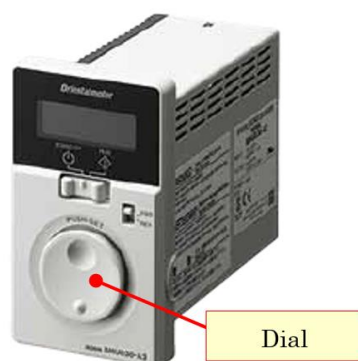
[When the dial is removed]